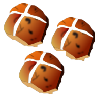
Hot cross buns are eaten on Good Friday