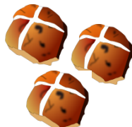
Hot cross buns are eaten on Good Friday