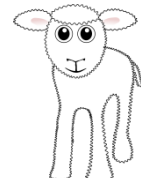
Many people eat lamb at Easter

Easter egg roll is an old tradition where children push an egg through the grass with a long-handled spoon. In the picture you see President Obama at the Easter egg roll at the White House in 2009.