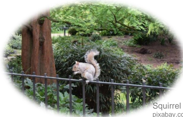
Squirrel in Hyde Park