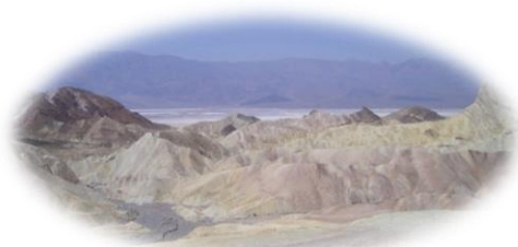
Death Valley pixabay.com